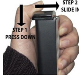
Photo C Close with keypad facing away from you

Optional screw for the battery compartment is in bag with remote