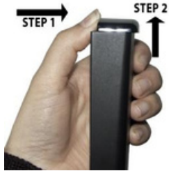
Photo A Open with keypad facing you